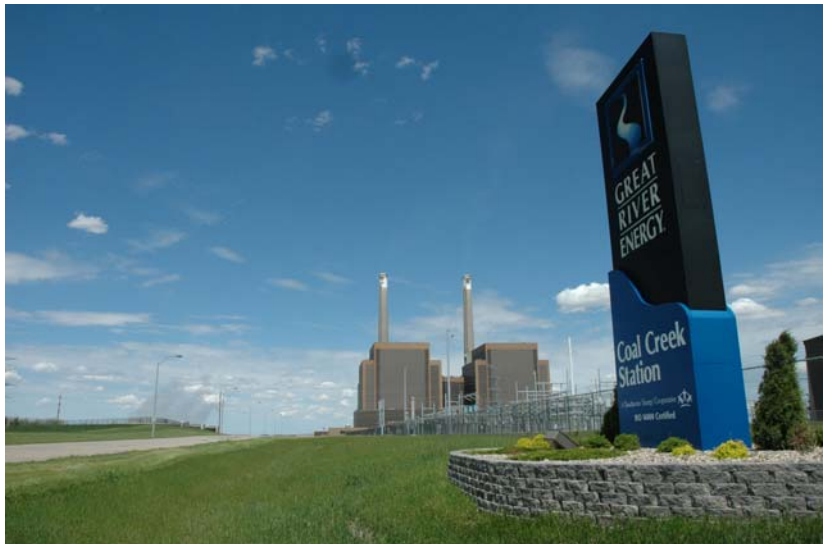
Coal Creek Station near Underwood, ND.

The Clean Coal Power Initiative project included the testing of a 115-ton per hour prototype dryer that supplied up to one-sixth of the coal for Coal Creek Station's Unit 2, a 546-megawatt unit. Round-the-clock testing of the prototype began on March 20, 2006.